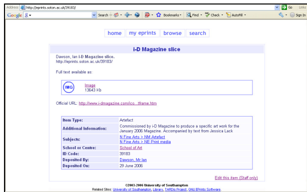
Figure 1: Abstract page of WSA artefact from Southampton's IR